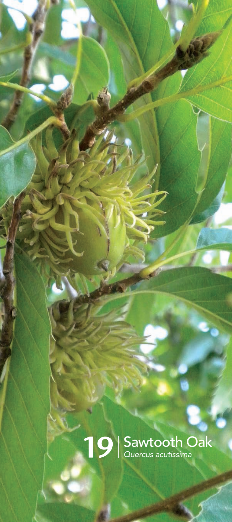
19 | Sawtooth Oak Quercus acutissima