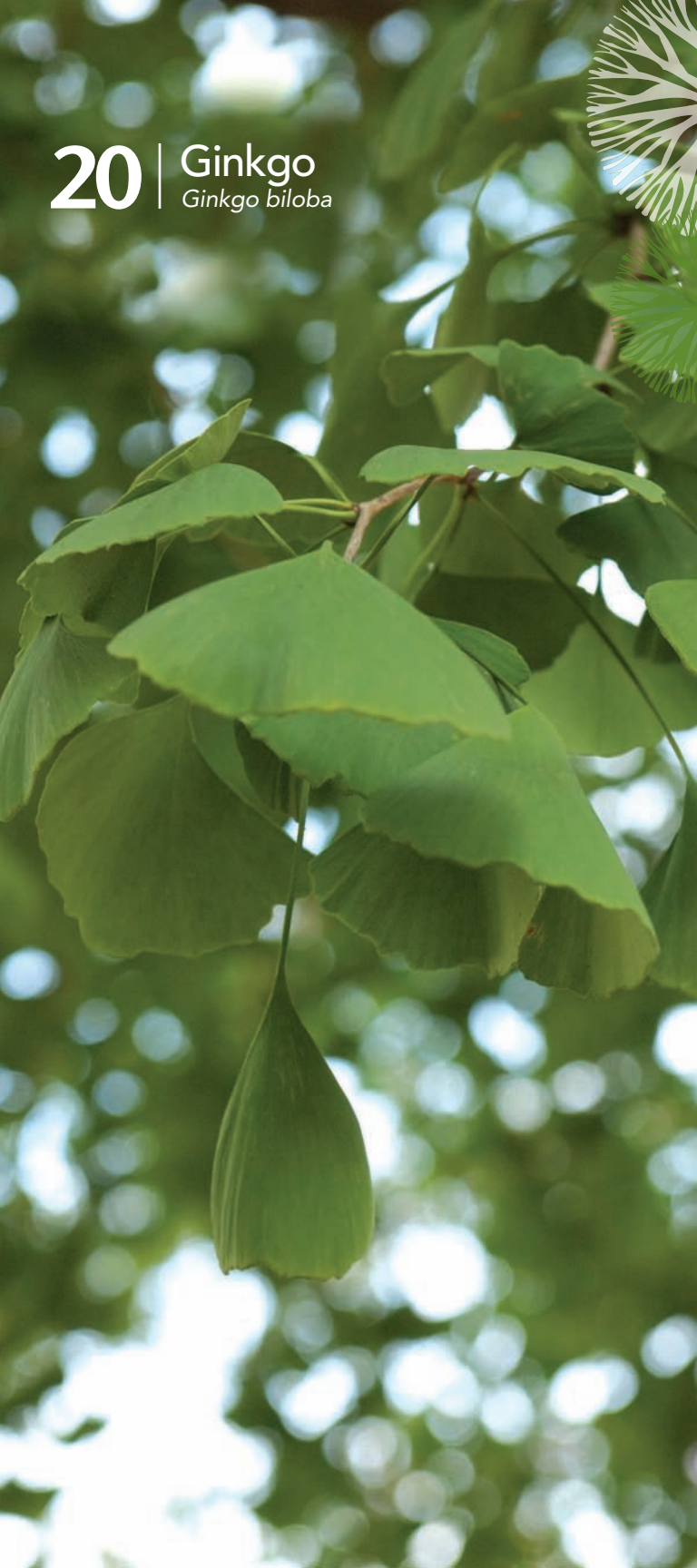
20 | Ginkgo Ginkgo biloba