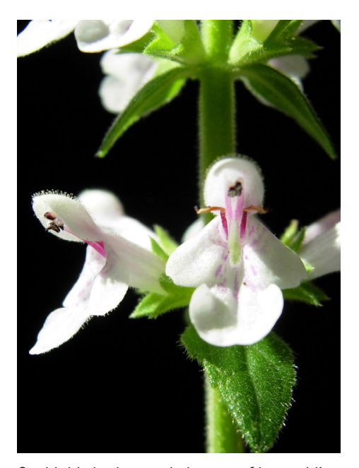
Could this hedge-nettle be one of he world's rarest plants?