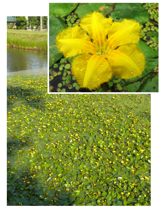
A thriving population of yellow floating heart in Lexington County.

multiplying as serious invasive pests. Small ponds may be covered by thick growths of this species, which leads to light diminution, among other things. We have specimens of yellow floating heart from several years ago in