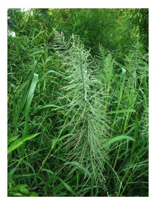
Amazon sprangletop, newly reported from South Carolina.