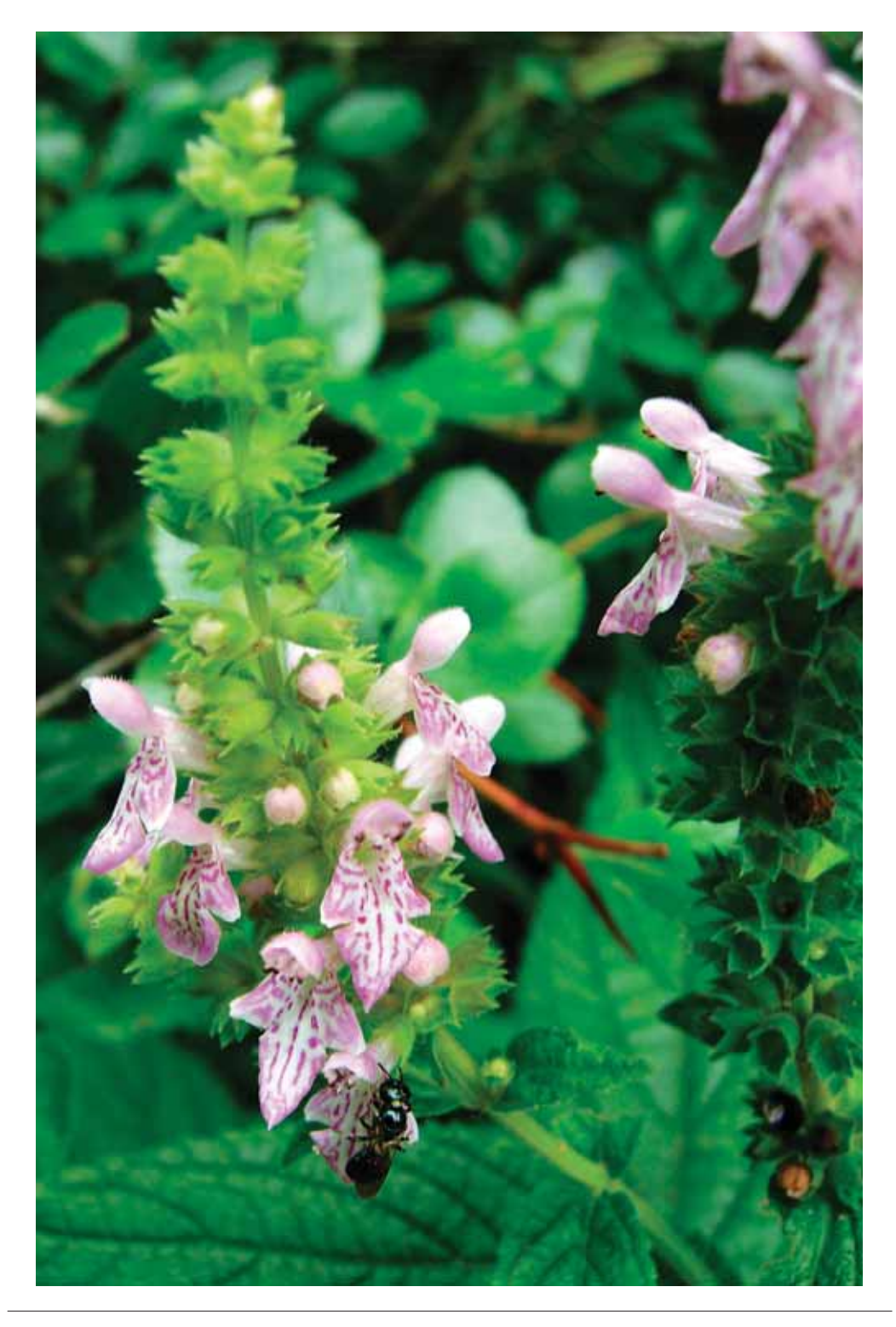
Fig. 3. Stachys iltisii: living plants (population of Nelson 26653, LeFlore County OK) with unidentified pollinator (?) at lower left.